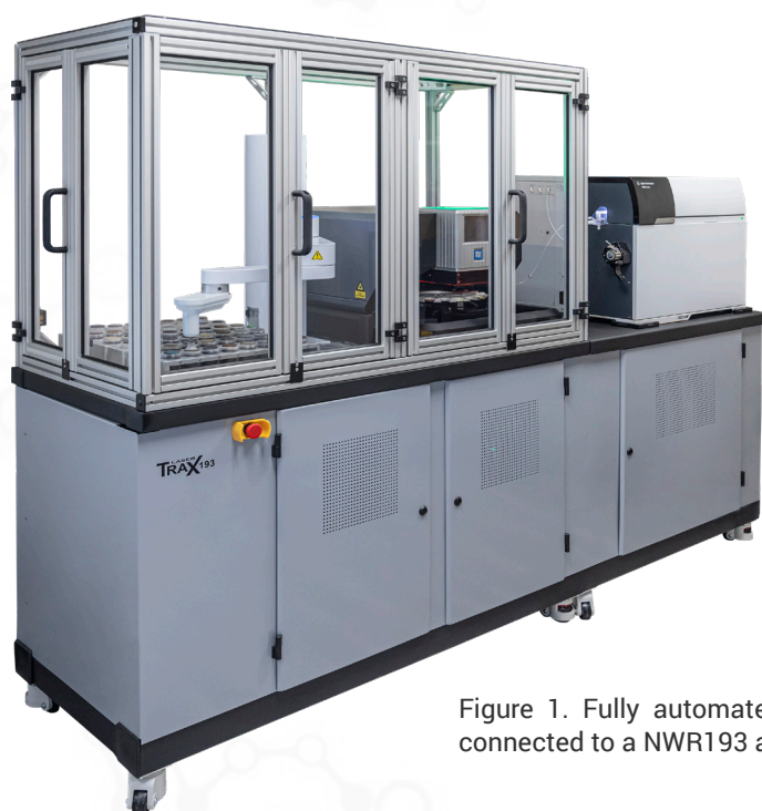
Figure 1. Fully automated LaserTRAX system connected to a NWR193 and Agilent 7900.