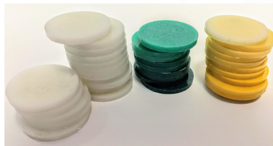
Figure 2. Li-tetraborate fusions and plastic beads suitable for Laser SC analysis