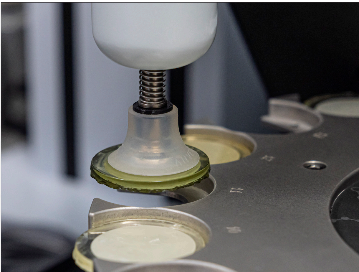
Figure 4. Samples loaded into Laser SC Carousel in preparation for analysis.